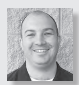
CONTACT for information about

Athletes registered for team sports are expected to attend practices, games, and tournaments.